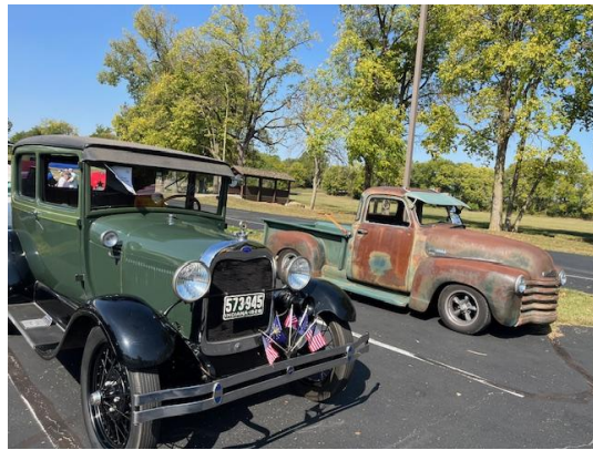
Submitted by Tom Kelly, November 2025