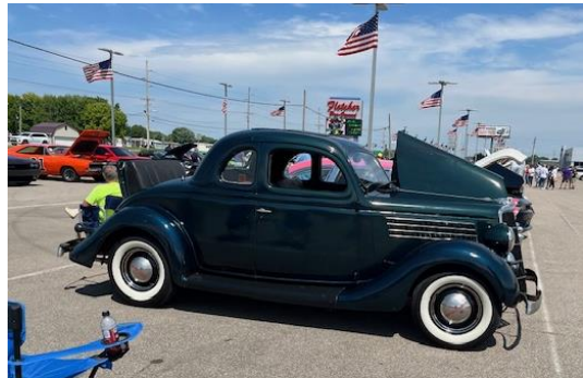
Fletcher Cruise-In September 2025