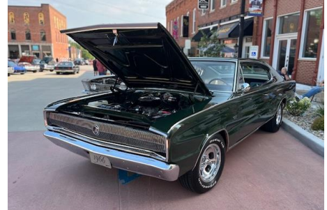
Submitted by Tom Kelly, September 2025