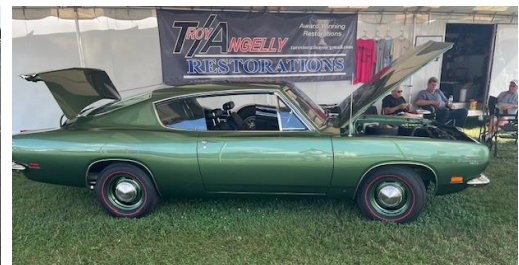
August 2025