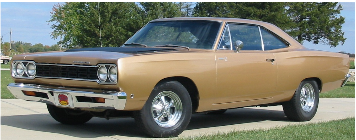
1968 Plymouth Road Runner: This car spent 37 years in Georgia and has its original sheet metal. No rust anywhere! The engine was built by Racing Head Services out of Tenn. and is a .060 over 440 with a Weiland